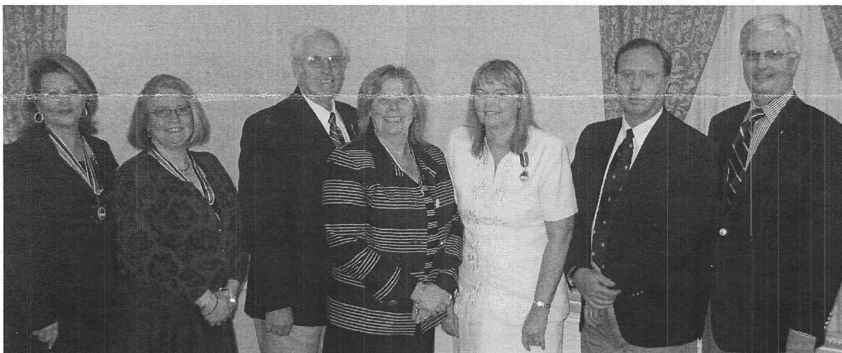
2009-2011 OFFME Board