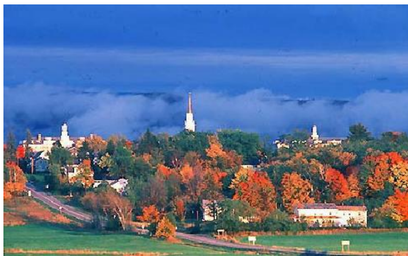
View of Middlebury, Vermont

They are taking reservations. 802-388-4961