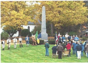
Village Green, Roxbury, CT