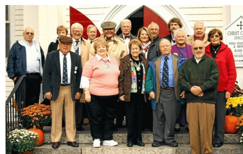
2010 Annual Meeting – Roxbury, Connecticut